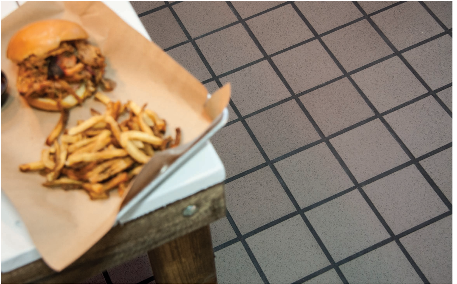
PURITAN GREY - Abrasive